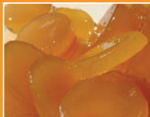
Syruped Ginger Slices.

www.gingerdragon.com/certificates-and-membership