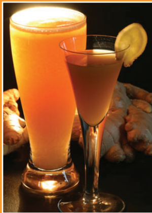
Create the perfect, warming drink with our natural Ginger Extract/Juice.