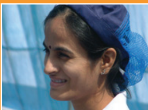
The factory are committed members of SEDEX, and have recently been audited against the SMETA standard.