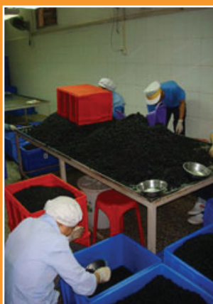
The beans are checked thoroughly in our BRC certified factory before they are packaged.