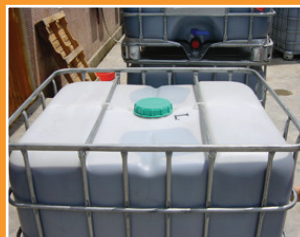
Typical packaging format food grade IBC 1,200Kgs.

Light and dark soy sauce available in a variety of formats and specifications.