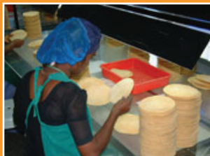
Every Poppadum is thoroughly inspected prior to release.