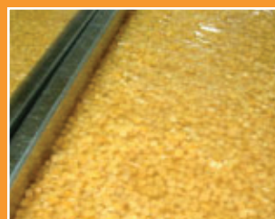
Diced crystallised ginger.