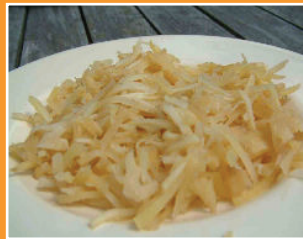
Shredded Ginger, pickled or in brine.

www.gingerdragon.com/certificates-and-membership