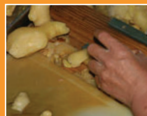
Fresh Ginger being prepared.