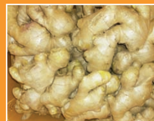
Air Dried Ginger