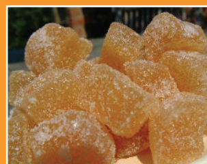
8/16 Crystallised Ginger.