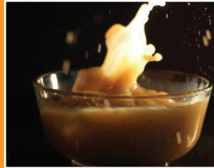
Our Ginger Extract/Juice has a consistent strength & flavour.