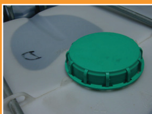
Other packaging options available on request.