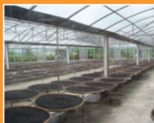
Black Salted Beans being dried.

Traditionally black salted beans are fermented yielding very high TVC results. We offer these beans in a sterilised format for use in the production of sauces and ready meals.