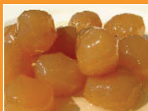
30/35 Stem Ginger.